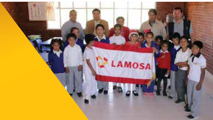
Escuela Digna Program in Tlaxcala.