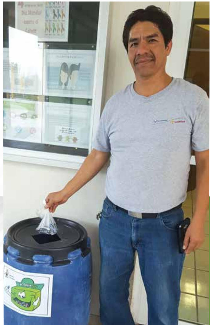
Battery-collection campaign, Benito Juárez Tile Plant, N.L.

*Estimation based on the assumption that one alkaline battery pollutes 167 thousand liters of water.