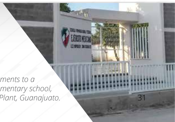
Improvements to a rural elementary school, Italgres Plant, Guanajuato.