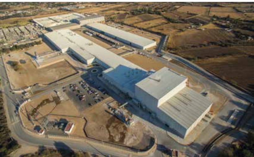
New porcelain product plant in Guanajuato generating 300 direct jobs.

In 2016, Grupo Lamosa grew through acquisitions such as the purchase of Cerámica San Lorenzo in South America and the continued expansion of its operations in Mexico. As a result of these actions, the company continued to contribute to enhancing economic development and the creation of job opportunities in the regions where it operates. For example, Grupo Lamosa's different businesses built new production centers during the year, including a new plant for manufacturing porcelain products in the state of Guanajuato.